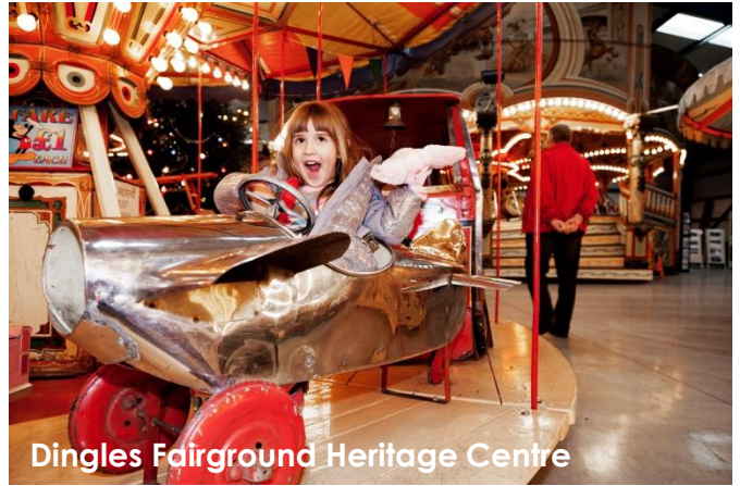
Dingles Fairground Heritage Centre

Visits contributed £4.6 million to local tourism economy